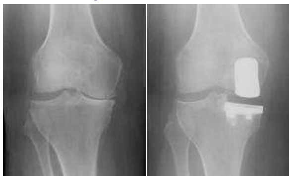
BEFORE Unicompartmental Arthritis

An incision is made on the front of the knee, just to the inside of center. The damaged bone is cleared away. The surfaces are prepped and shaped to hold the new components. The new components are aligned and secured to the thigh bone and shin bone.